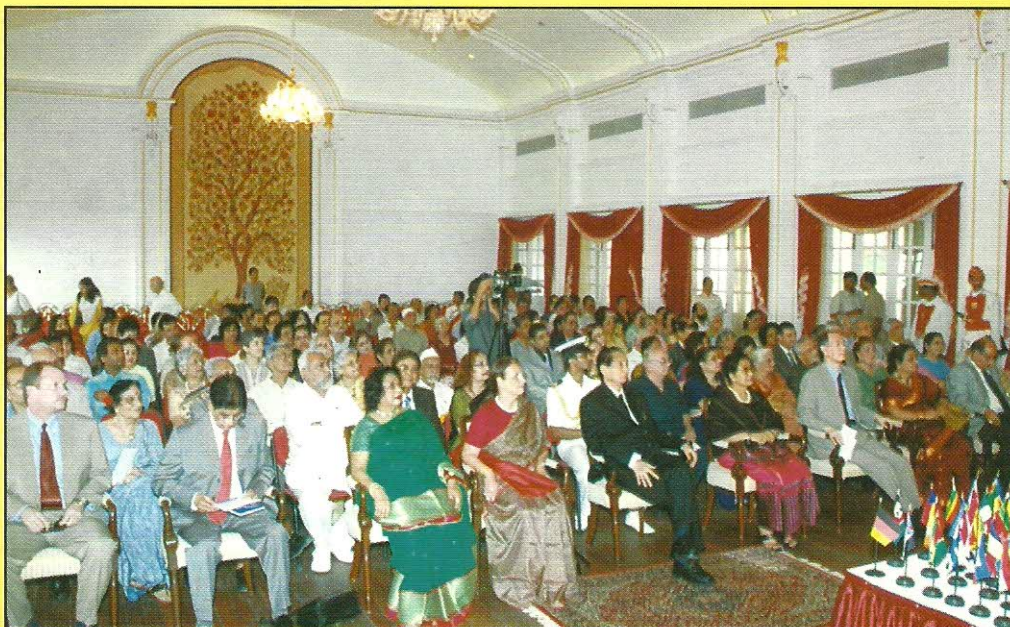
A view of the audience and distinguished guests on the occasion of UN Day at Governor House, Mumbai